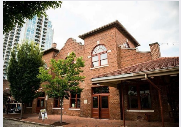
Market Hall, 214 E Martin Street in Raleigh

Don't miss this unique opportunity to connect with new and returning lawmakers in a relaxed and engaging setting. NCHA's Legislative Reception is the perfect platform to build meaningful relationships with your elected officials and share the stories that matter most to your hospital and the health of your community. Let's come together to foster dialogue, strengthen connections, and make your voice heard. Your perspective can help shape the future — join us and be part of the conversation!